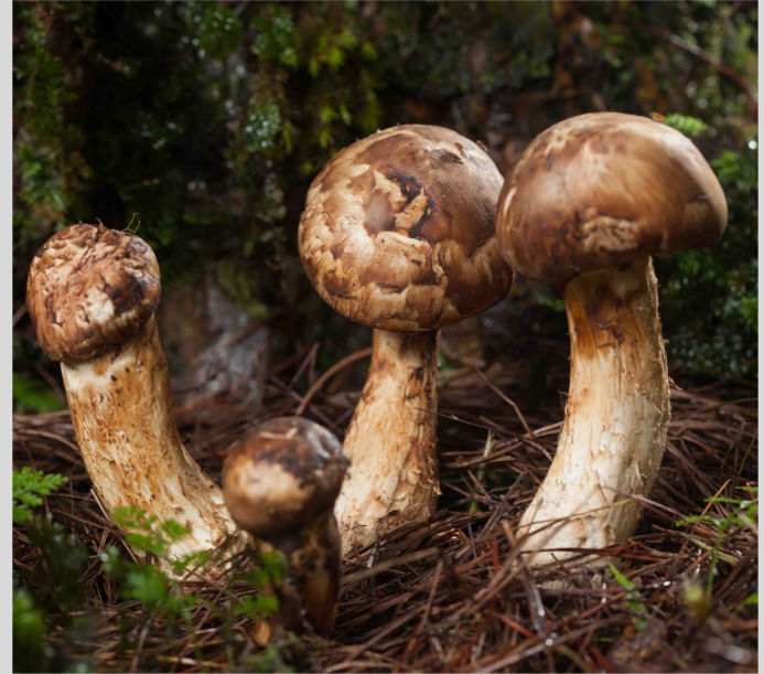
MUSHROOM FESTIVAL - GENEKHA 5 NIGHTS 6 DAYS