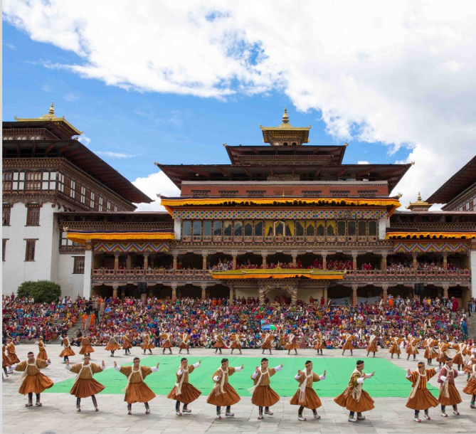
COLORS OF THIMPHU FESTIVAL 5 NIGHTS 6 DAYS