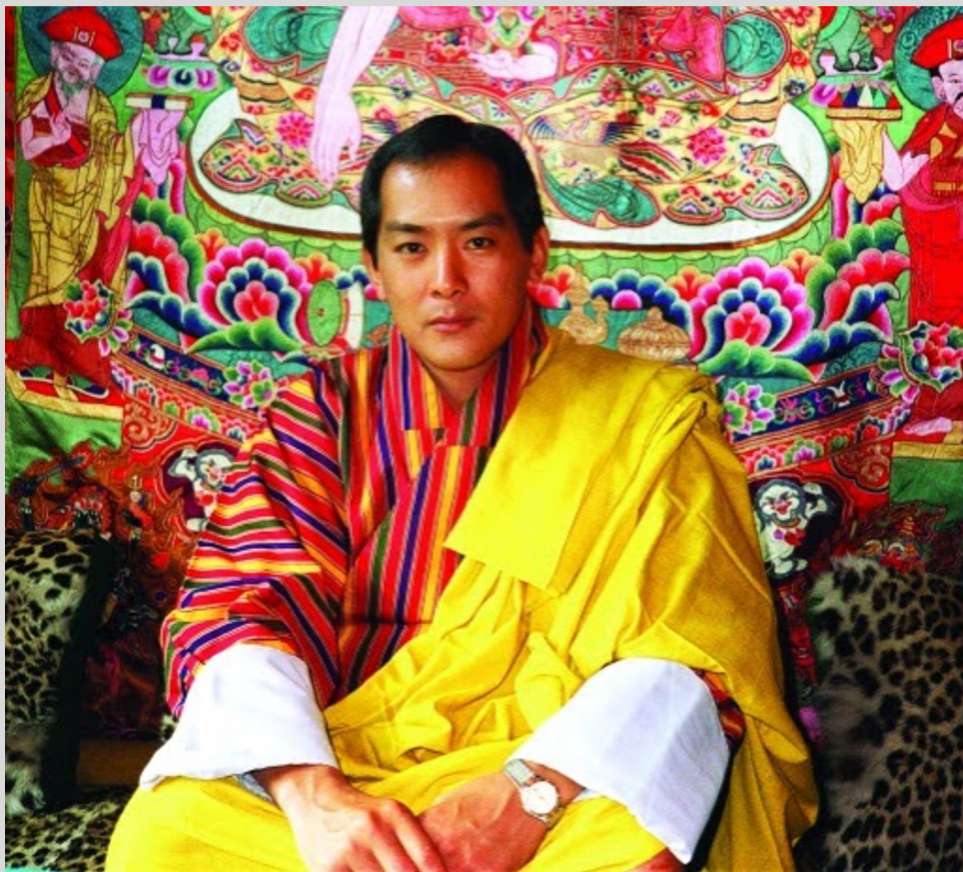
FOURTH DRUK GYALPO