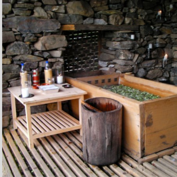
HOT STONE BATH