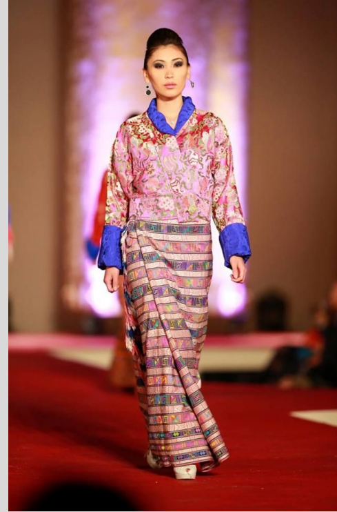
KIRA (For Women)