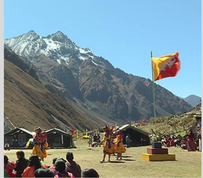
JOMOLHARI MOUNTAIN FESTIVAL 11 NIGHTS 12 DAYS