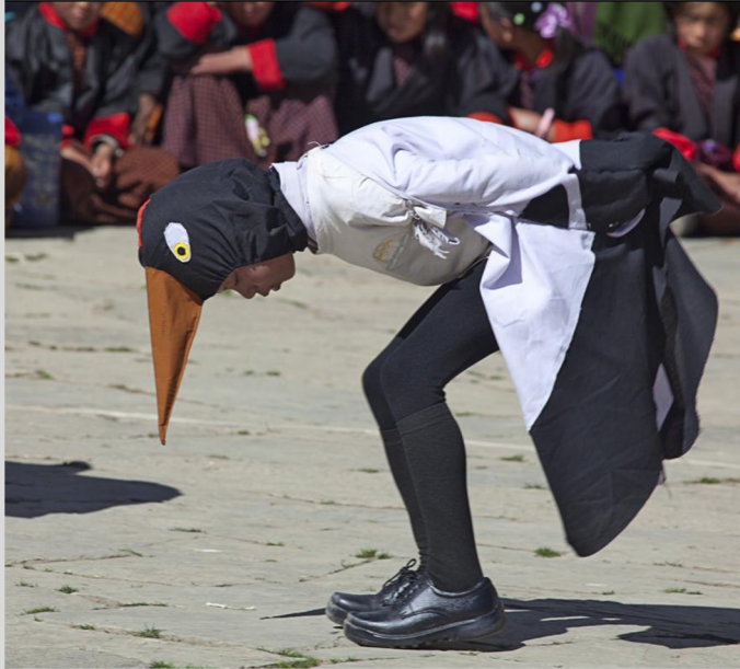
BLACK NECKED CRANE FESTIVAL 6 NIGHTS 7 DAYS