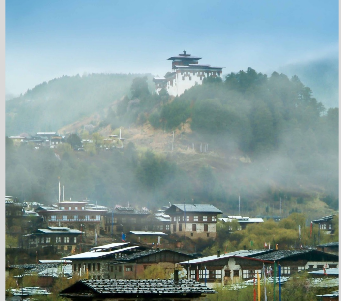
BHUTAN PEACEFUL JOURNEYS 8 NIGHTS 9 DAYS