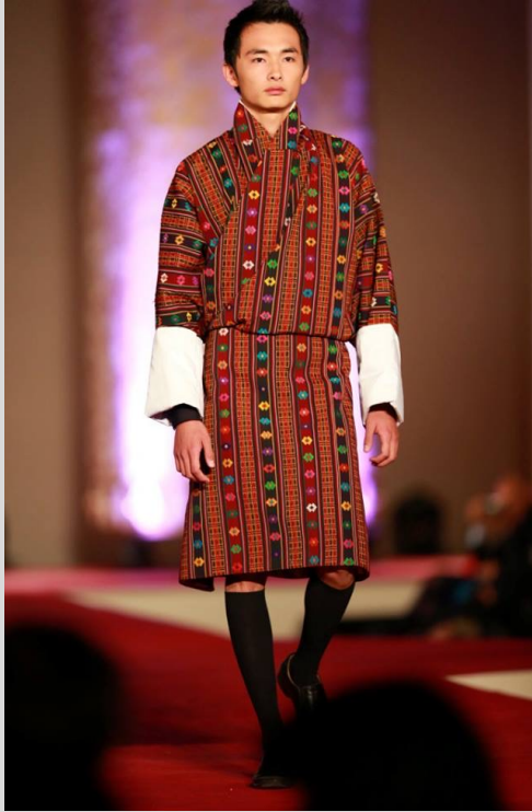
GHO (For Men)