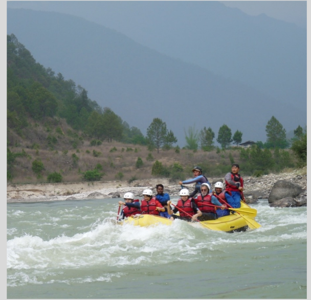
RAFTING & KAYAKING