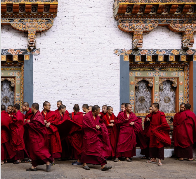
GLIMPSE OF BHUTAN 4 NIGHTS 5 DAYS