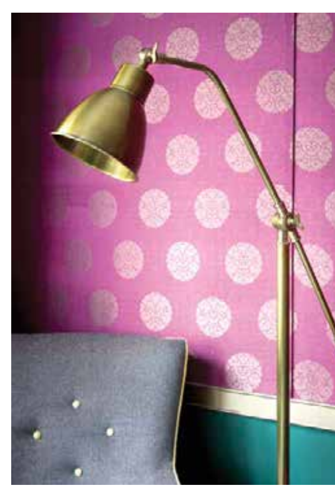
Banarsi-woven Damask silk commissioned by Anita Lal to evoke patterns of clouds line the guest bedrooms in a plethora of exquisite colours, adding texture and extravagance along with the mountain-woven clouds of Kashmir used on the beds on chilly mountain nights.