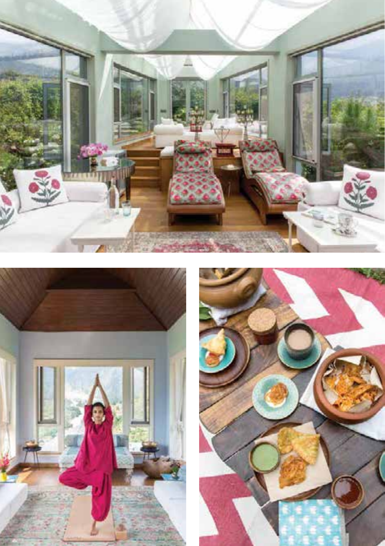
The stargazing pavilion in the upper reaches of Sitara's English-terraced garden comes alive by candlelight as guests recline under the crispest skies found anywhere in the world.