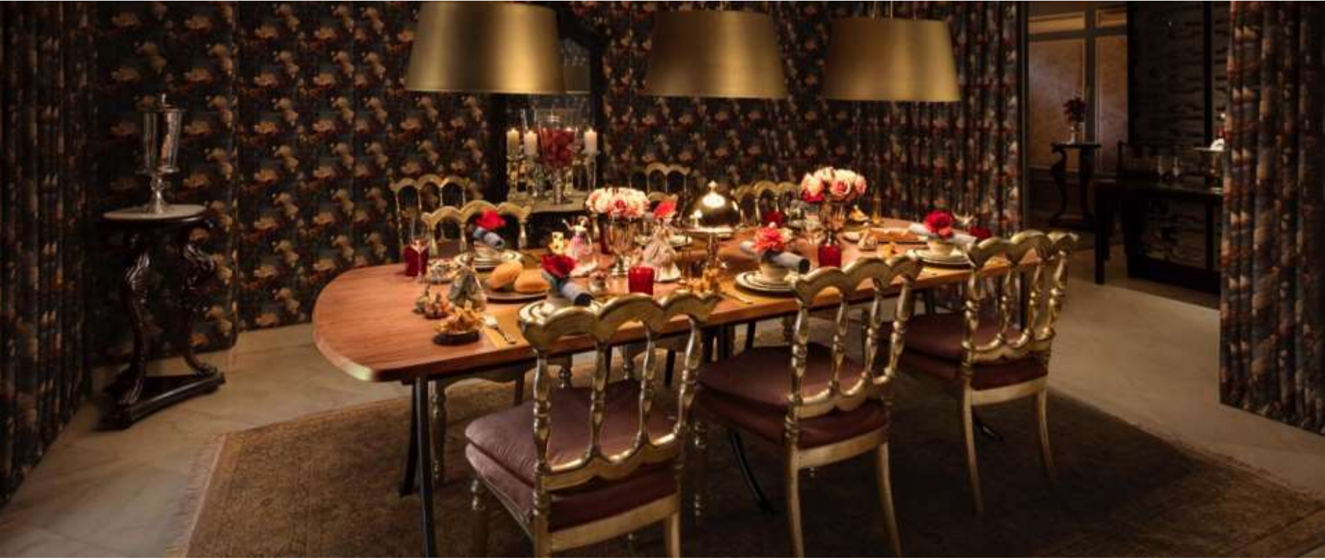
Museum Dinner at the Night Room