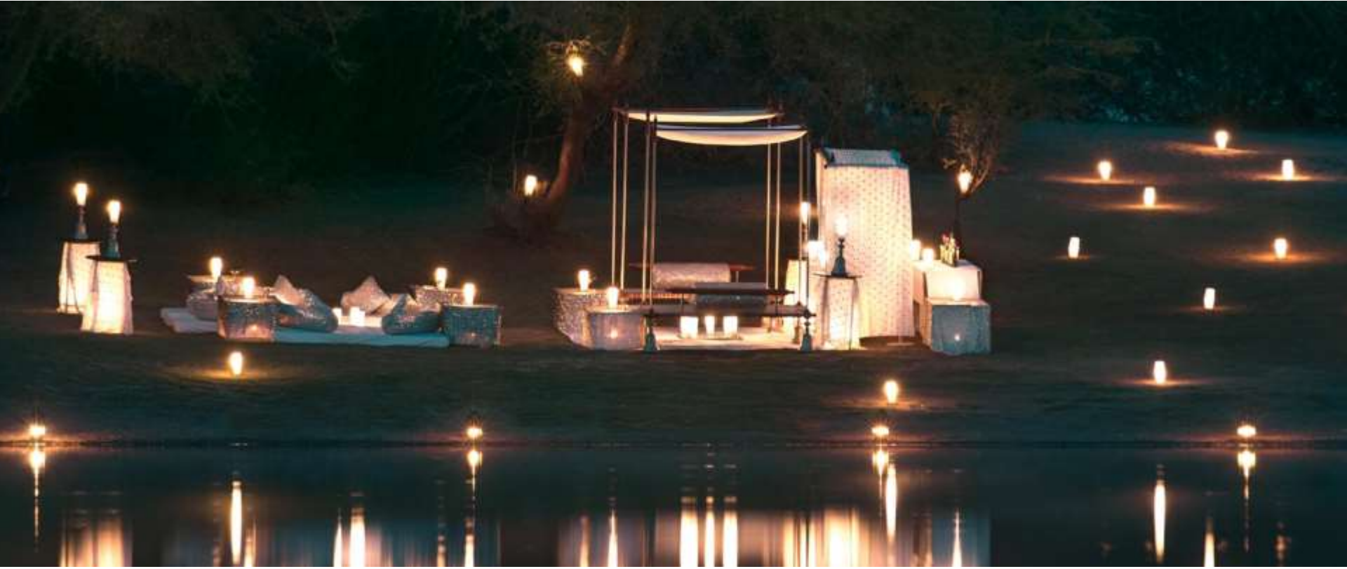
Sundowners at Darbari