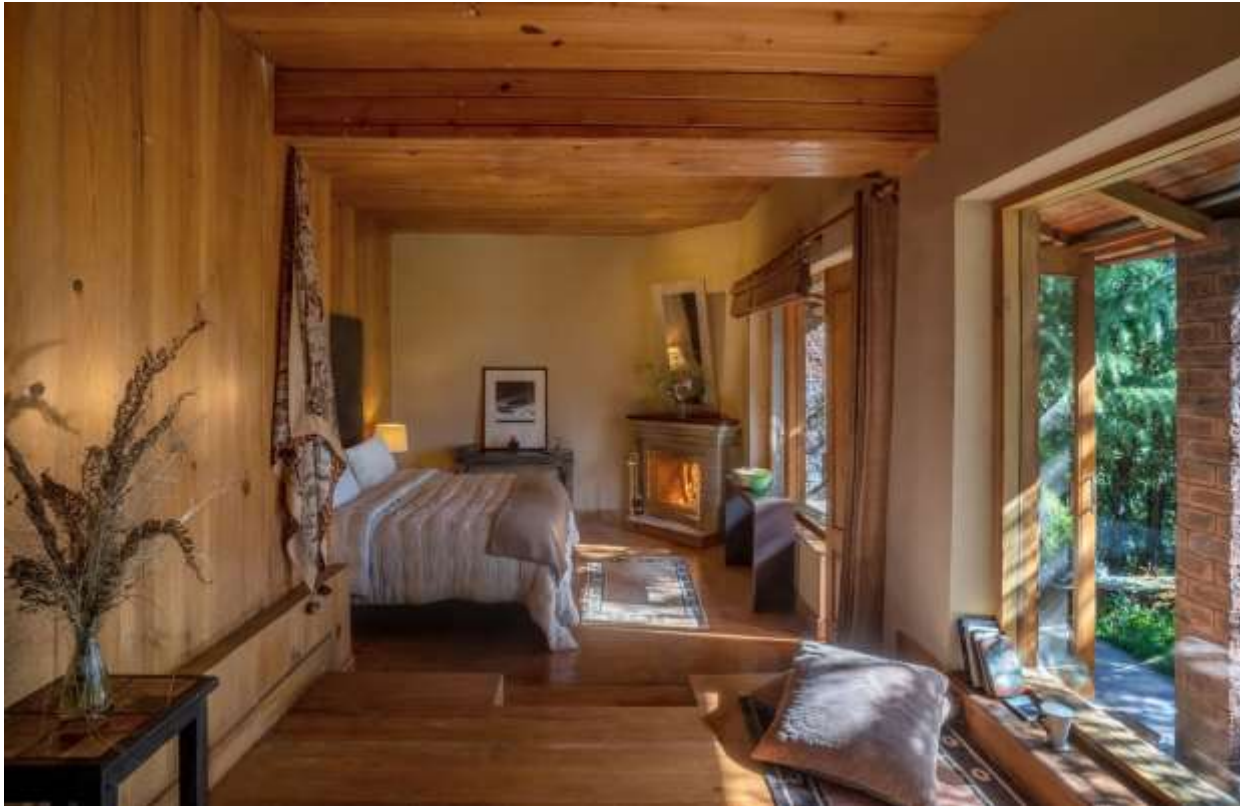
The Lodge | Spacious dining and sitting areas, 3 luxury en-suite rooms, fireplaces