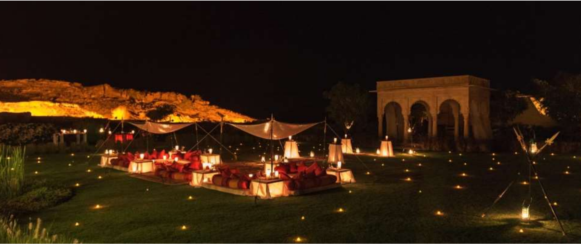
Thar dinner at Celebration Garden