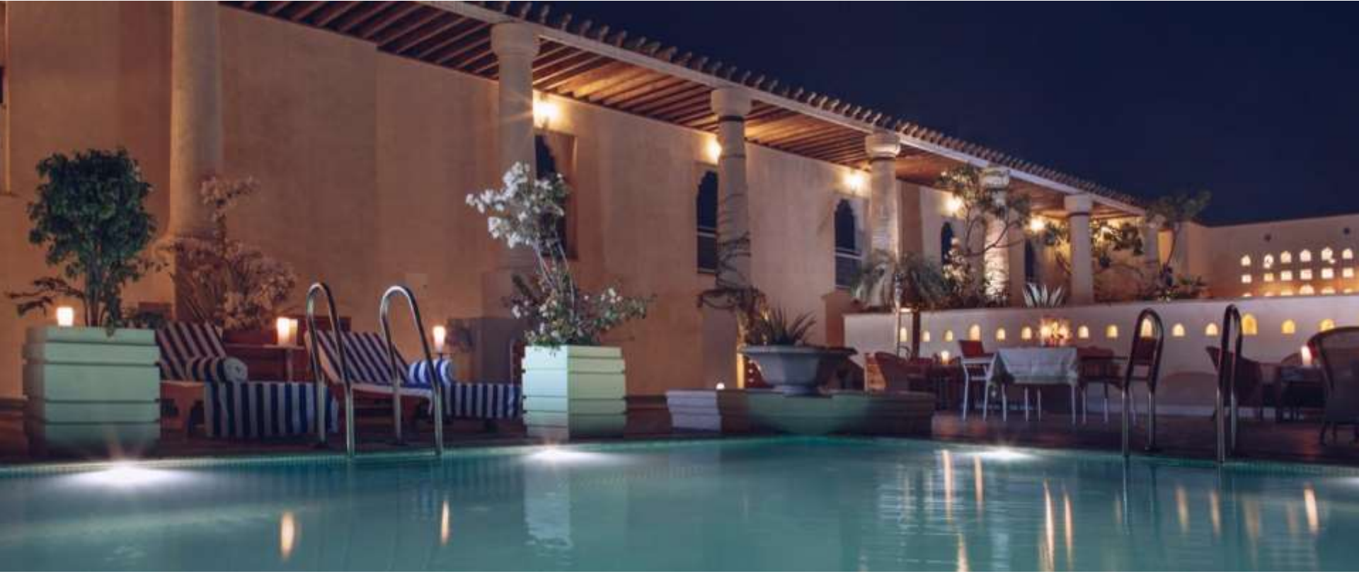
Crescent Grill and Dinner