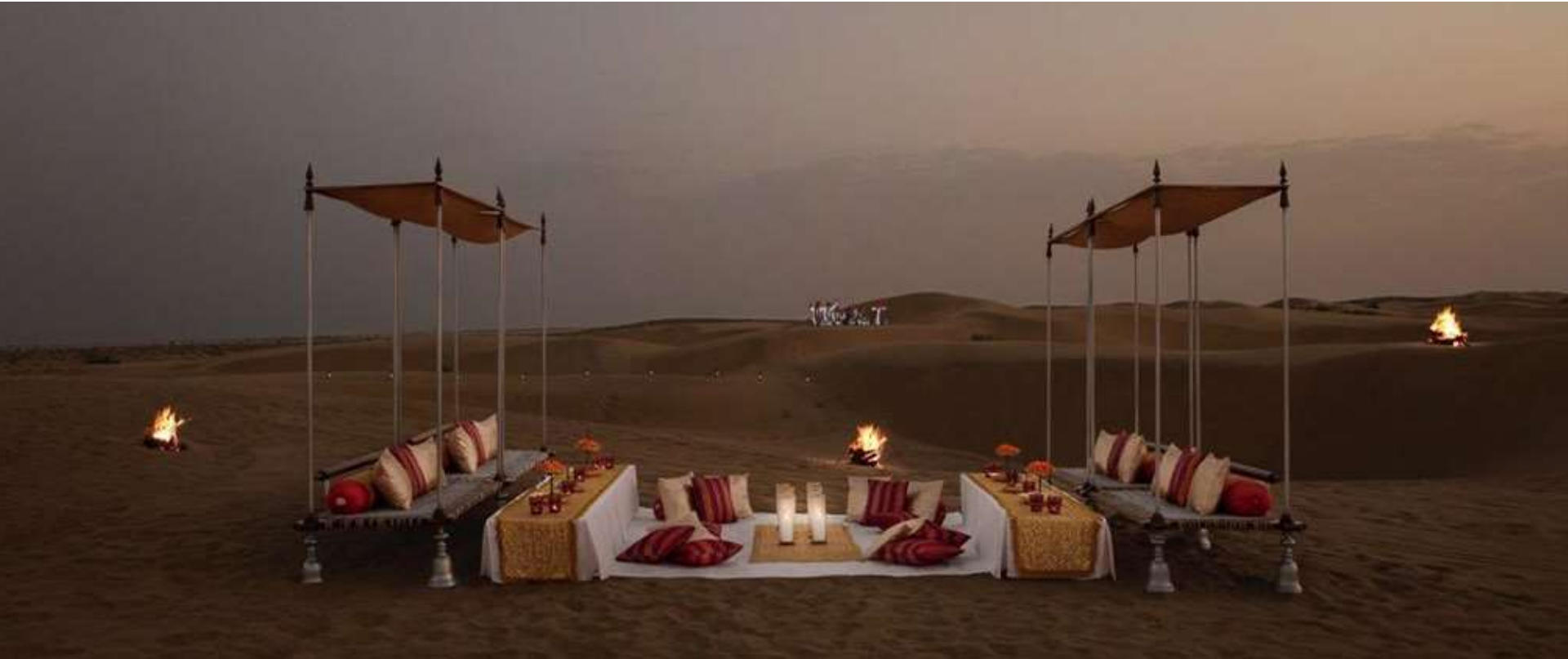
Dinner on the dunes