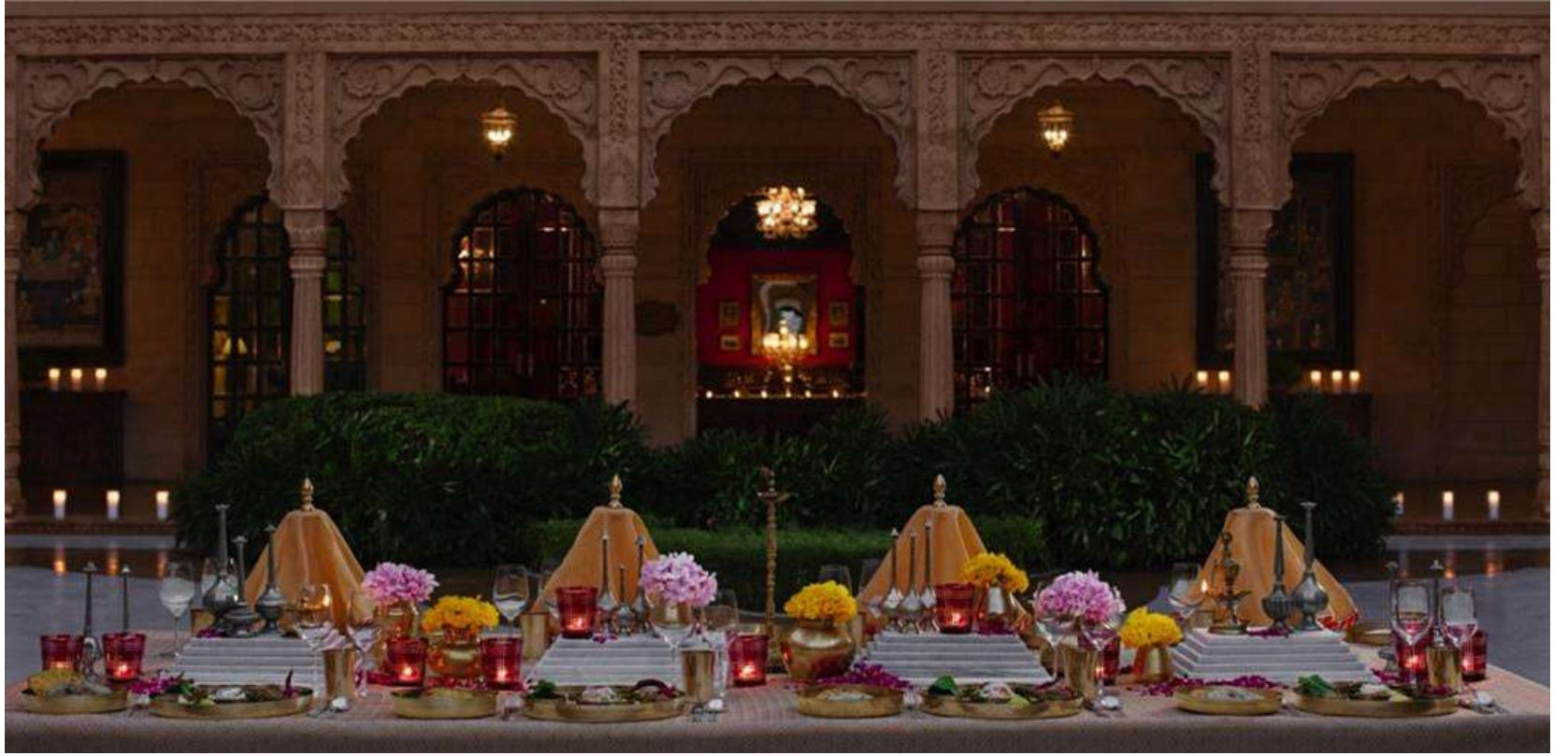
The signature thali dinner at the Central Courtyard