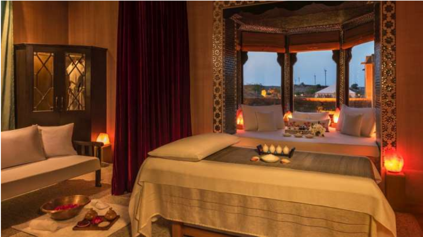
Rait – The Spa is named in reverence to the sand and pays homage to the setting, the sea of rait upon which it has been fashioned