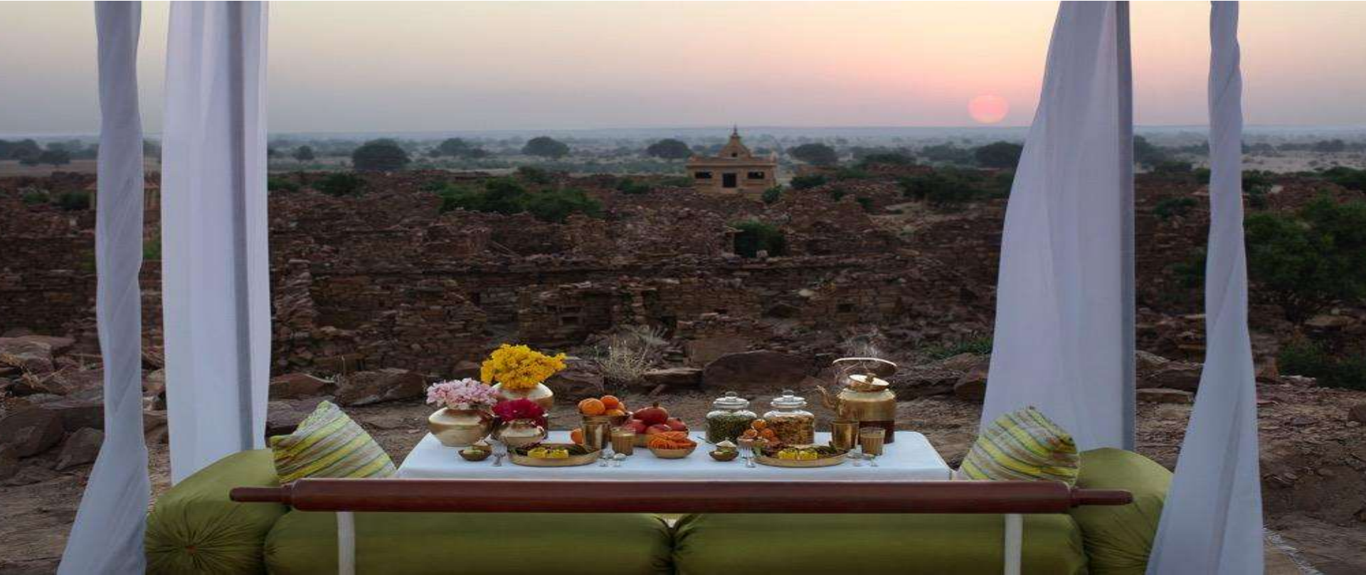
Breakfast with the peacocks