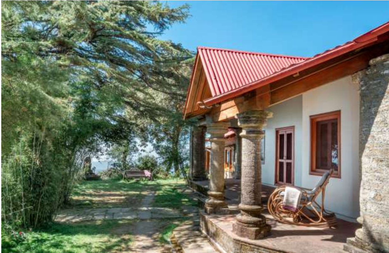
Cottage | Spacious dining and drawing rooms, 3 luxury en-suite rooms, fireplaces